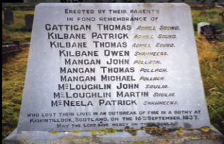
The victims' gravestone in Kildowan Cemetery, Achill

with effect from Section 10 of the Housing (Scotland) Act, 1938, as amended by Section 10 of the Housing (Scotland) (Amendment) Act, 1939, and by the Housing (Scotland) (Amendment) Act, 1940