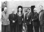
Unveiling of commemorative plaque in Kirkintilloch, 1997

Achtaíodh reachtaíocht úr maidir le lóistín na n-obrithe talamhaíochta in Albain i Mí Iúil 1938 mar thoradh ar an tine sa bhoth go páirteach. Bhíothas ag déim le bardais logánta glacadh le fodhlithe daingne maidir le lóistín na n-obrithe séasúrtha. Rinne Bardas Kirkintilloch an méid seo sa bhliain 1939.