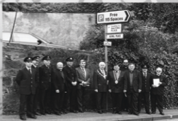
Naming of Achill Place, Kirkintilloch, 1997, with representatives of Achill and Kirkintilloch communities

Tugadh ómós do na hÉireannaigh óga a chaill a mbeatha cúpla uair ó shin. Léadh aifreann cuimhniúcháin ar a son ar oileán Acla sa bhliain 1987 agus iad caillte le leath chéad bliain. Nochtadh plaic chuimhniúcháin 10 mbliana ina dhiaidh sin agus ainmíodh sráid i gKirkintilloch 'Plás Acla' ar an lá céanna. Tá cuimhniú na heachtra seo sa traidisiún logánta ar Oileán Acla agus i gKirkintilloch mar aon agus beidh go ceann í bhfad is cosúil.