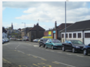
View looking west