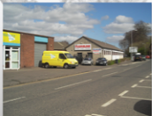
View of the site in 2007. View north & east